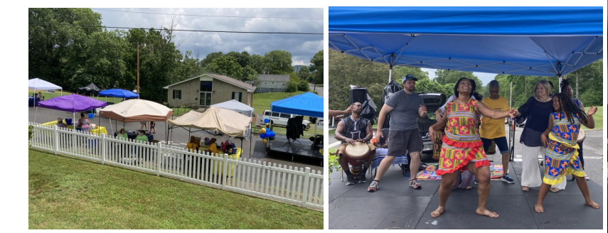
Street Fair 2023