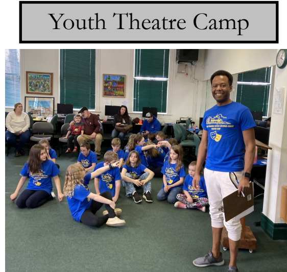
Youth Theatre Camp