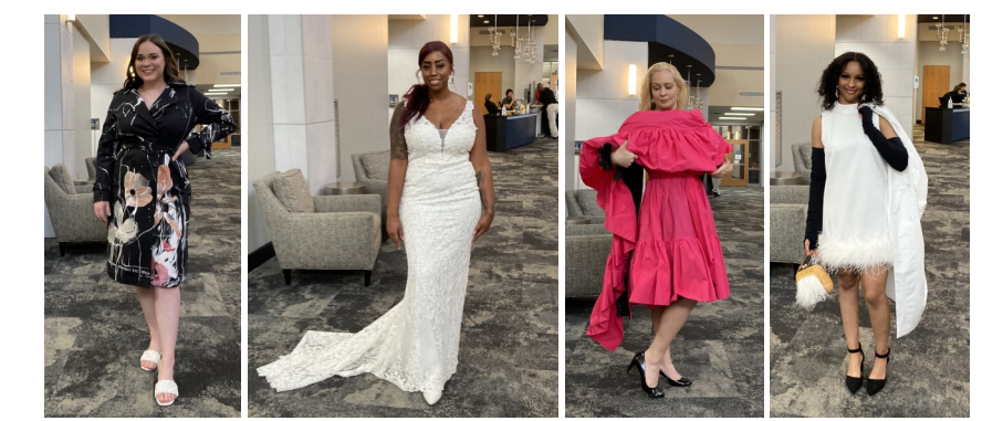
International Fashion Show Fundraiser